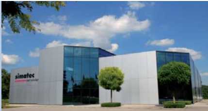
simatec ag, Wangen a. Aare, Switzerland